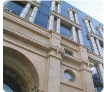
Business centre Alia Tempora, St. Petersburg