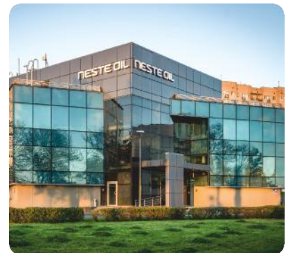
Neste office building, St. Petersburg