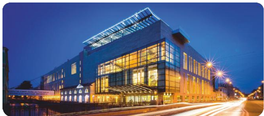
Mariinsky Theatre Second Stage, St. Petersburg

Current industrial, public, commercial and residential facility project is a system with many complicated technologies requiring high level of engineering and construction skills to achieve necessary results.